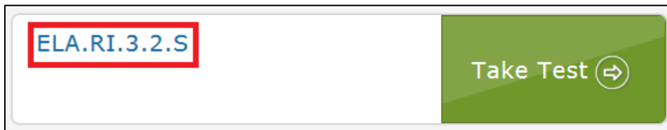
Figure 1. Screensheet from Kite Student Portal that demonstrates a released testlet name

Table 2 describes the labels from the previous image.