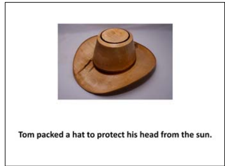
Alt text: a hat