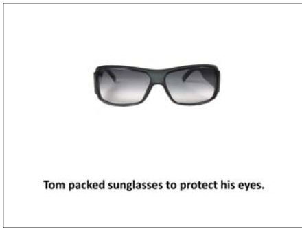
Alt text: sunglasses