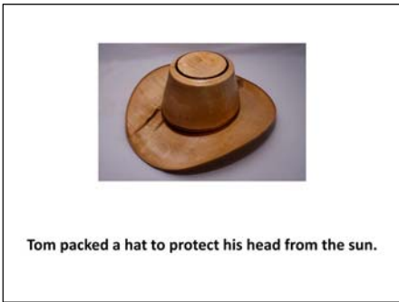
Alt text: a hat