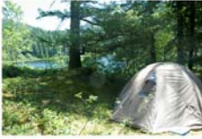
Alt text: a tent in the forest