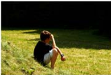
Tom wanted to go on a new adventure.