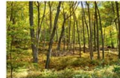
Tom decided to go camping in the woods.