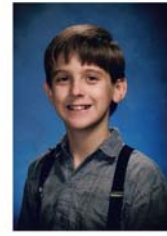
Tom was a boy who liked adventures.