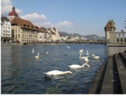
Alt text: ducks swimming in a river by the city